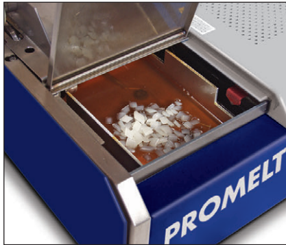
Open glue chamber