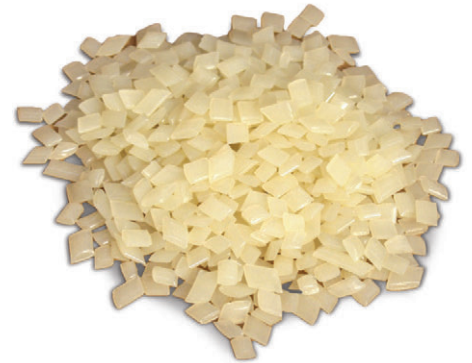
Hot melt granules in raw form